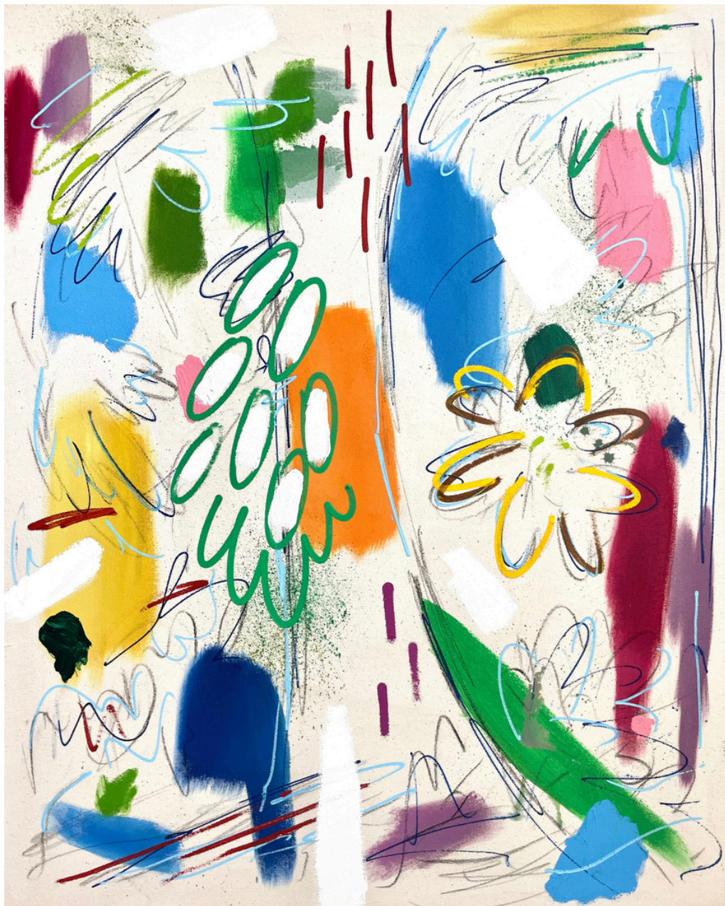
Daniel Roibal "Camino a Sóller" Oil and charcoal on canvas 100 x 80 cm 3.500 € + IVA