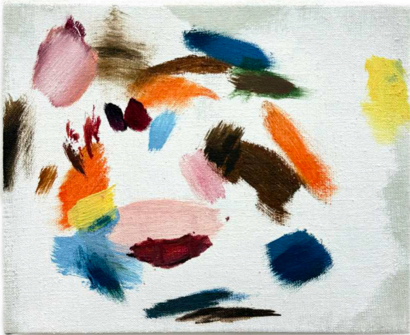
Daniel Roibal "Asiento 6 B" Oil on linen 20 x 26 cm 900 € + IVA