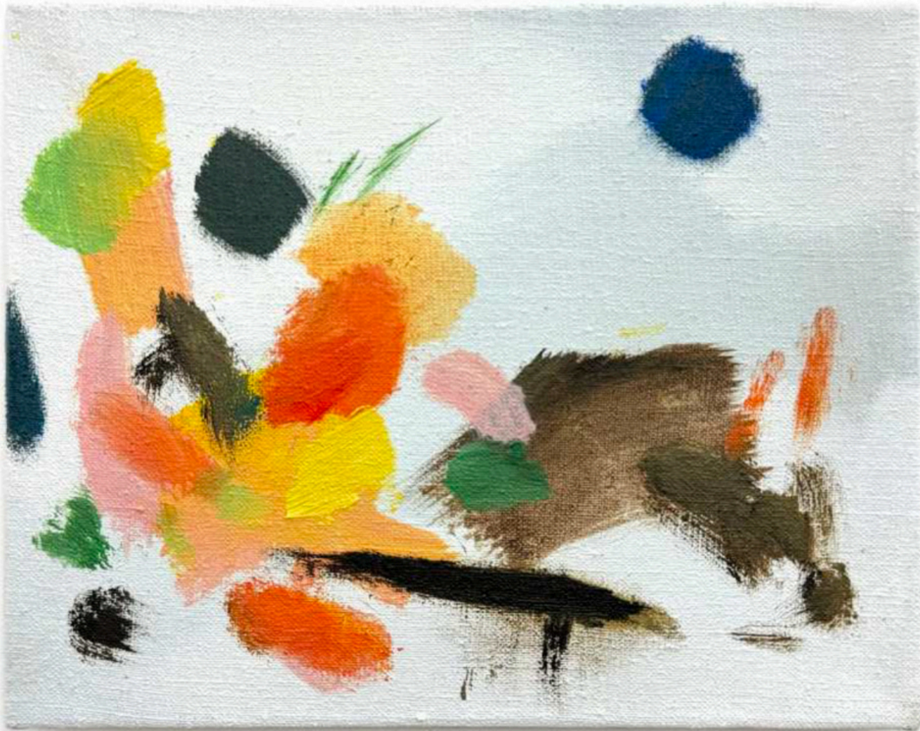
Daniel Roibal "Asiento 35 A" Oil on linen 20 x 26 cm 900 € + IVA