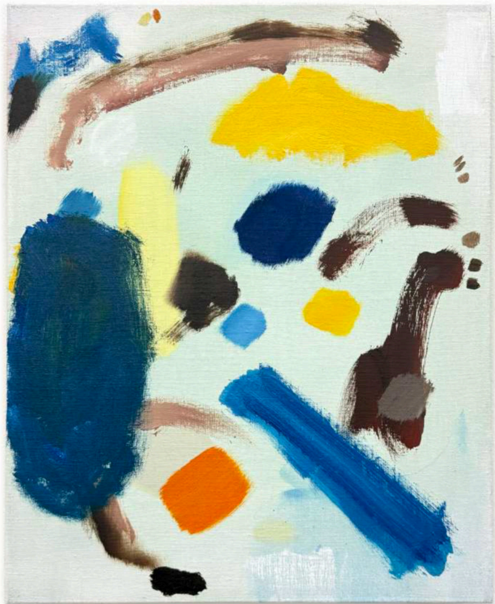
Daniel Roibal "Apaga la luz" Oil on canvas 50 x 40 cm 1.750 € + IVA