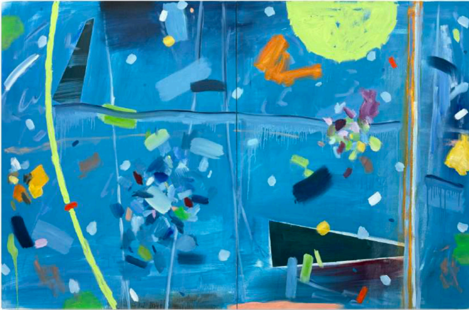
Daniel Roibal "Full moon" Oil on canvas 130 x 200 cm 6.400 € + IVA