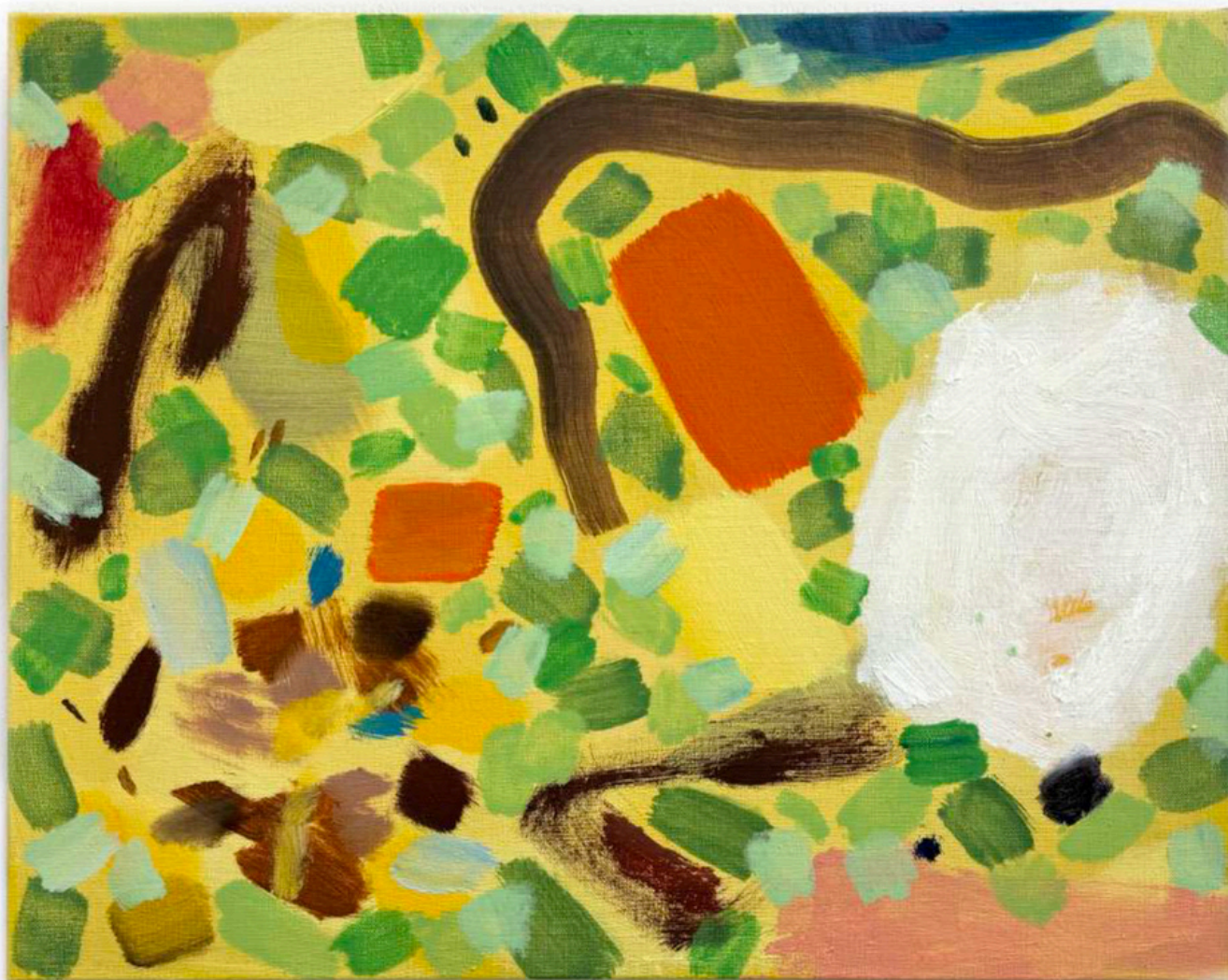
Daniel Roibal "Luz entre las hojas" Oil on linen 40 x 50 cm 1.750 € + IVA