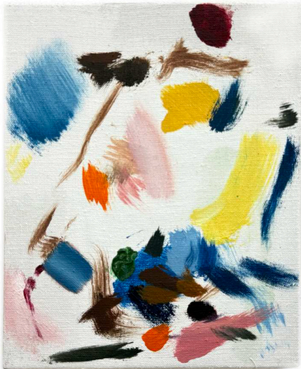
Daniel Roibal "Asiento 8 D" Oil on canvas 20 x 26 cm 900 € + IVA