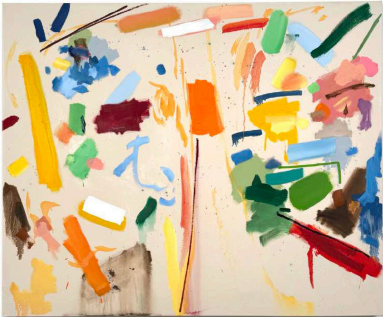
Daniel Roibal "Siesta bajo un naranjo" Oil on canvas 130 x 160 cm 5.600 € + IVA